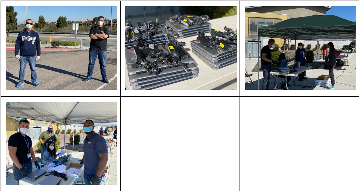
Photos of the Chromebook Distribution for San Ysidro Middle Middle School Students 4-17-20